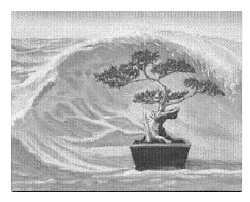
June 21-14, 2007 in Virginia Beach VA at the Cavalier Hotel on the beach.

If you attended our last Leaning Seminars in Saratoga, you already know that the seminars are the best learning experience in the North American bonsai world. If you did not attend you have heard the news on the ABS forum and from other attendees... so now join us all in Virginia Beach and experience the best!