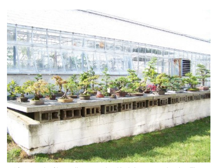
After a couple of hours all trees are placed in their temporary location. They will stay there for a few more weeks until they are ready to be placed inside the pit. Leaves will drop and needles will change color. Five months will pass before they are retrieved and the whole cycle will begin again.

We would like to recognize the volunteers' dedicated work and if you would like to know more about becoming one, you can email Connie Crancer at: <a href="mailto:ccrancer@umich.edu">ccrancer@umich.edu</a>