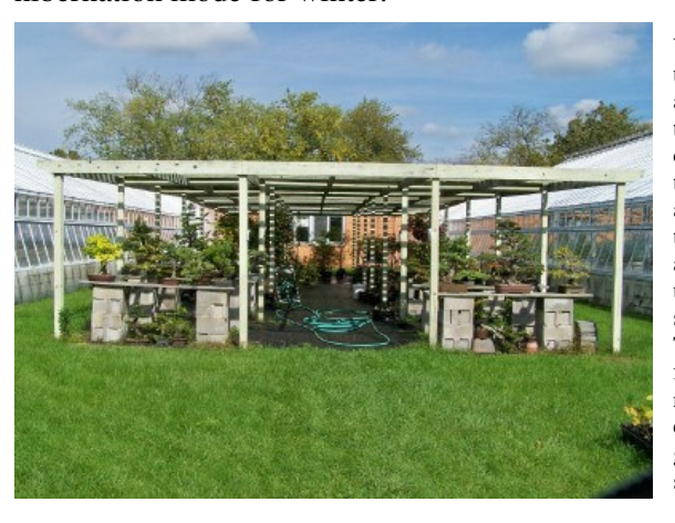
When not in the exhibition area, all bonsai trees sit comfortably in this special area where they are placed according to their unique shading needs. They are frequently rotated to ensure proper growth in all sides.

The following pictures illustrate how trees are moved from their regular stands to a place where they can receive more sun and gain more strength before entering into their hibernation mode for winter.