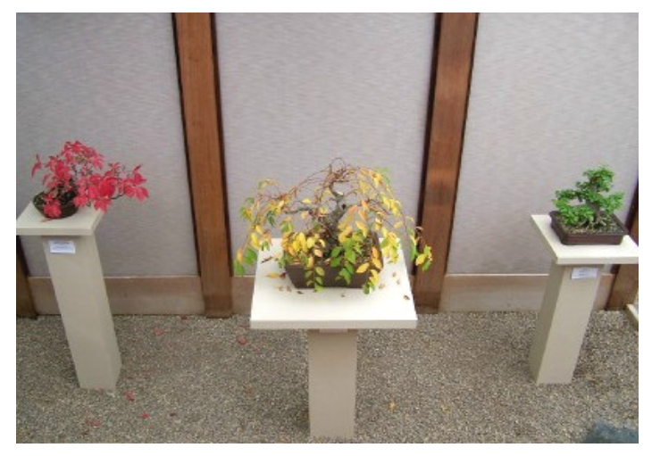
Exhibit area at Matthaei Botanical Garden

Have you ever wondered where all the bonsai trees from the MBG collection go when they are not at the exhibition at the conservatory?