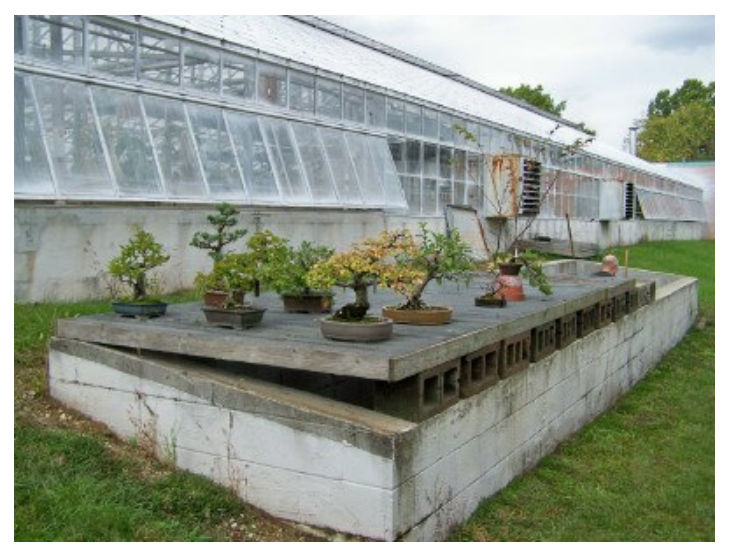
Now the trees could be moved and placed evenly over the pit. Note that the trees have sufficient space in between and they do not touch each other.