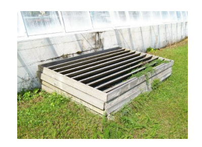
A close look let us appreciate the inner site of the pit.