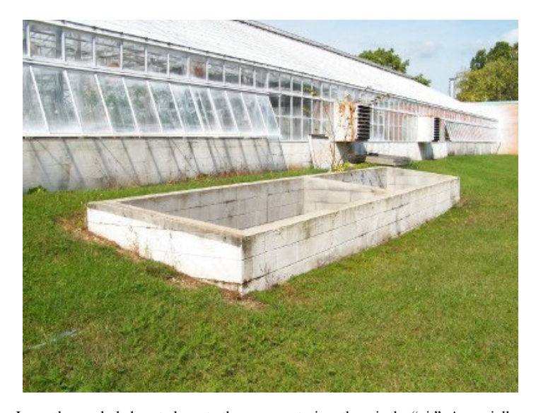
In another secluded spot closer to the conservatorium there is the "pit": A specially designed structure where bonsai trees are stored over the winter. It was specifically built to bury the trees in the ground and cover them with sand. The top has an inclination to allow some water and snow in, but not sunlight to avoid 'awakening' the trees before it is time.