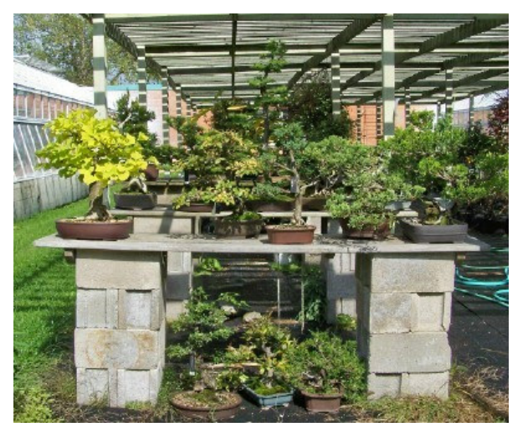
Sun loving trees are placed at the front row and medium-sun trees are farther in the back. The ceiling trellis is arranged in such way to allow more or less light into the area depending in which row they are located.